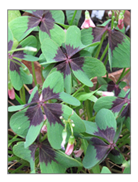
Iron Cross Good Luck Plant foliage

This is a dense herbaceous houseplant with a mounded form. This plant may benefit from an occasional pruning to look its best.