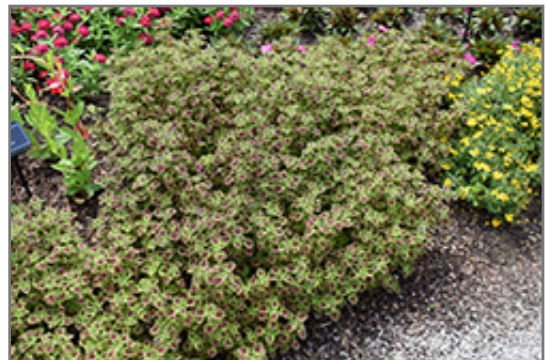
ColorBlaze Chocolate Drop Coleus