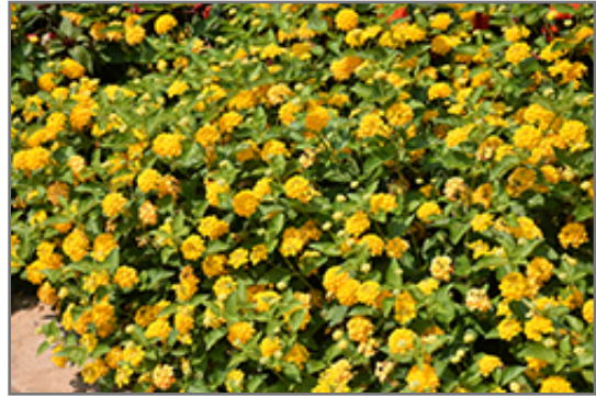
Lucky Pure Gold Lantana flowers