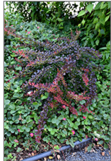
Lava Nugget Barberry