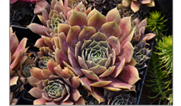
Silverine Hens And Chicks

Silverine Hens And Chicks is primarily valued in the home for its distinctive form, with the flower stalks towering over the foliage. It features unusual clusters of rose star-shaped flowers with deep purple bracts rising above the foliage in mid summer. Its attractive succulent pointy leaves emerge burgundy, turning deep purple in color with distinctive grayish green edges and tinges of silver throughout the year. The brick red stems can be quite attractive and add to the plant's interest.