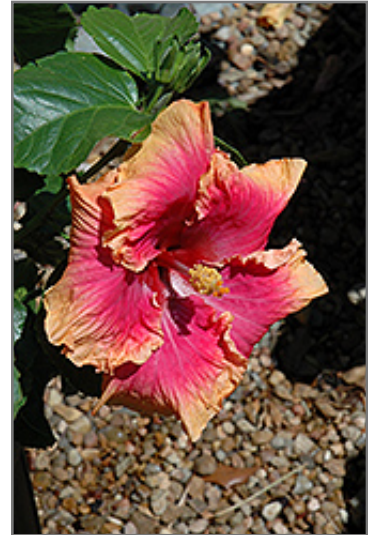
Pink Lemonade Hibiscus flowers

Pink Lemonade Hibiscus is a fine choice for the garden, but it is also a good selection for planting in outdoor pots and containers. With its upright habit of growth, it is best suited for use as a 'thriller' in the 'spiller-thriller-filler' container combination; plant it near the center of the pot, surrounded by smaller plants and those that spill over the edges. It is even sizeable enough that it can be grown alone in a suitable container. Note that when growing plants in outdoor containers and baskets, they may require more frequent waterings than they would in the yard or garden.